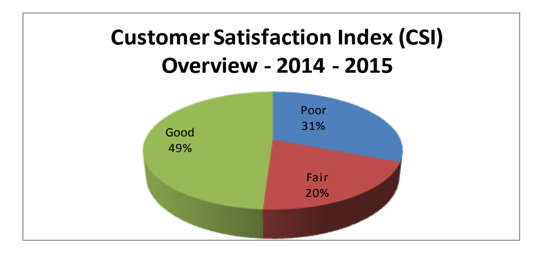
"Simplifying Service Delivery"

Below is a pie chart showing the outcomes of the satisfaction surveys conducted in the period 2014 - 2015